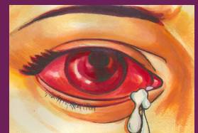
Ropy mucus discharge