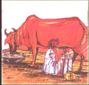
If the eye is hit by a cow's tail