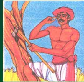
If saw dust falls into the eye