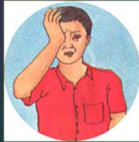
If dust falls into the eye