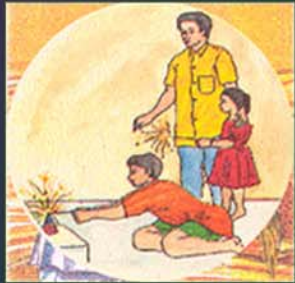
If the eye is hit by crackers.