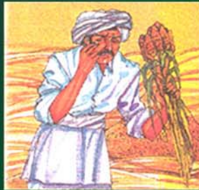
If any trivial things like grass roots hits the eye