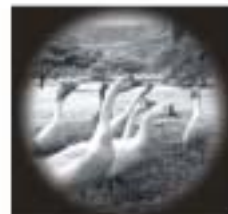
Early glaucoma is hardly noticeable