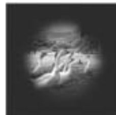
Without proper treatment it will advance and eventually ...