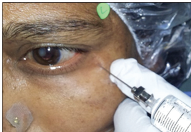
Figure 2: Needle entry site at the extreme inferotemporal corner for performing regional eye block

From the extreme corner, it is easier to stay far away from the globe and would prevent any needle injury to the