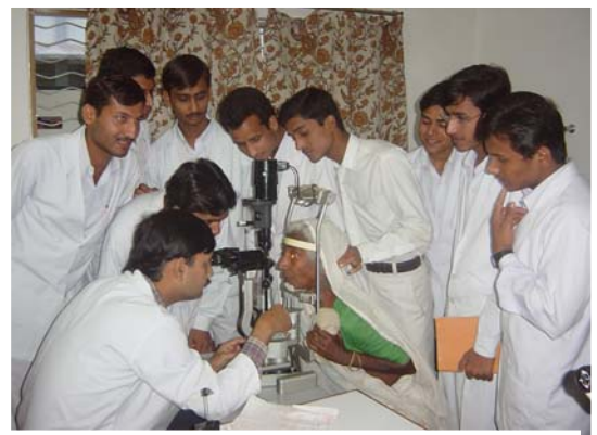
Ophthalmic Assistants course started to cope up with the demand

"Problems are usually accompanied by Opportunities" . In 1999, the Trust decided to introduce training for Nurses and Ophthalmic Assistants. On one hand, there were only one or two institutes which offered such trainings and so the courses became instantly popular and on the other, the Trust now had a cadre of professionals trained in their own hospital environment keen to serve as full-time employees or interns within their dedicated eye and general hospital.