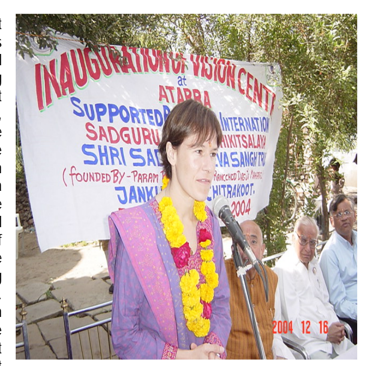
Inauguration of Attara Vision Centre in Uttar Pradesh (photo: 1)

Before starting of Vision Centre at Manikpur a public meeting was arranged in presence of local leaders. Aim of the public meeting was to gather community support explaining the eye care scenario, prevailing blindness problems in the region and the role a Vision Centre could play in eliminating such problems. These meetings created a ownership sense of in community and a grand inaugural ceremony marking the opening of the Centre was held. The same trend was observed at the opening of second Vision Centre in Attara. The community members took on responsibility of mike pamphlet announcements and distribution which revealed that "traveling 40-50 km for getting their