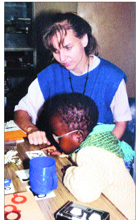
Testing vision at near distance with a Bust card matching picture and object

Assessment is not possible at a very young age but full colour vision develops very