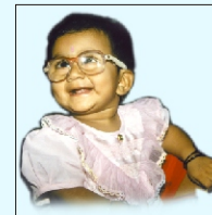
Aphakic spectacles after cataract surgery